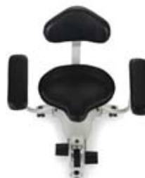
Saddle Seat (Optional)