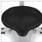
Saddle Seat (Optional)

3800 E. Centre Ave. Portage, MI 49002 t: 269 329 2100 f: 269 329 2311 toll free: 800 787 9537